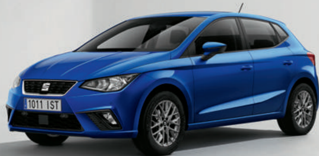
Model shown: Ibiza SE with optional 16" Design alloy wheels, Vision Pack Plus and Mystery Blue metallic paint.