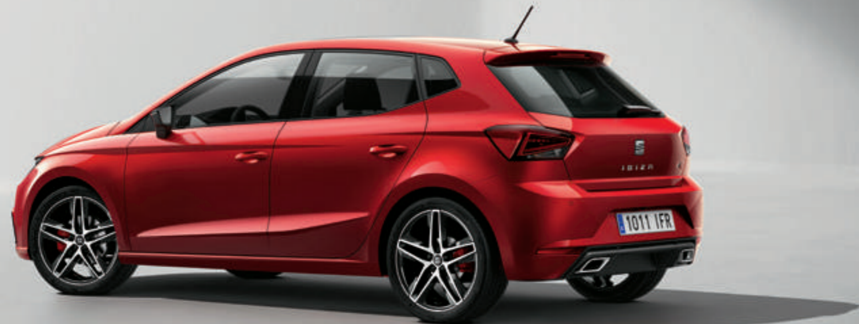
Model shown: Ibiza FR with optional 18" 'Performance' bi-colour machined alloy wheels, Vision Pack Plus and Desire Red special metallic paint.