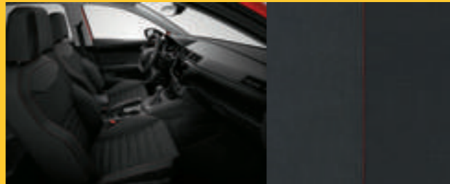
Black Alcantara with red stitching FR