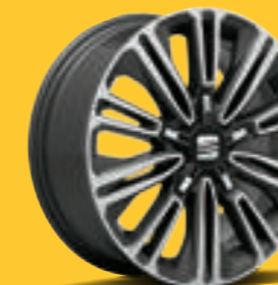
16" 'Design' Machined Alloy Wheels XC