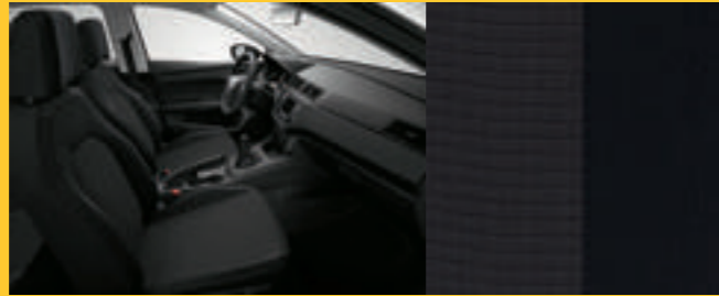
Titan Black Cloth S

Why have one choice, when you can have so many? With the All-new Ibiza, the fun's only getting started. So aim higher and make it yours with the choices of upholstery colours, fabrics and finishing touches that suit you, not us.