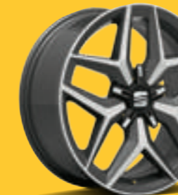
17" 'Dynamic' Bi-colour Machined Alloy Wheels XC

S /S/ SE /SE/ FR /FR/ XC XCCELLENCE /XC/