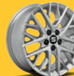
'Design' Alloy Wheels SE