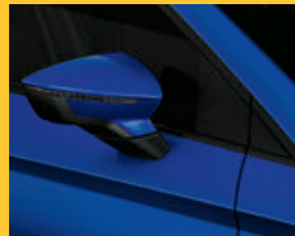
Mystery Blue** S SE FR