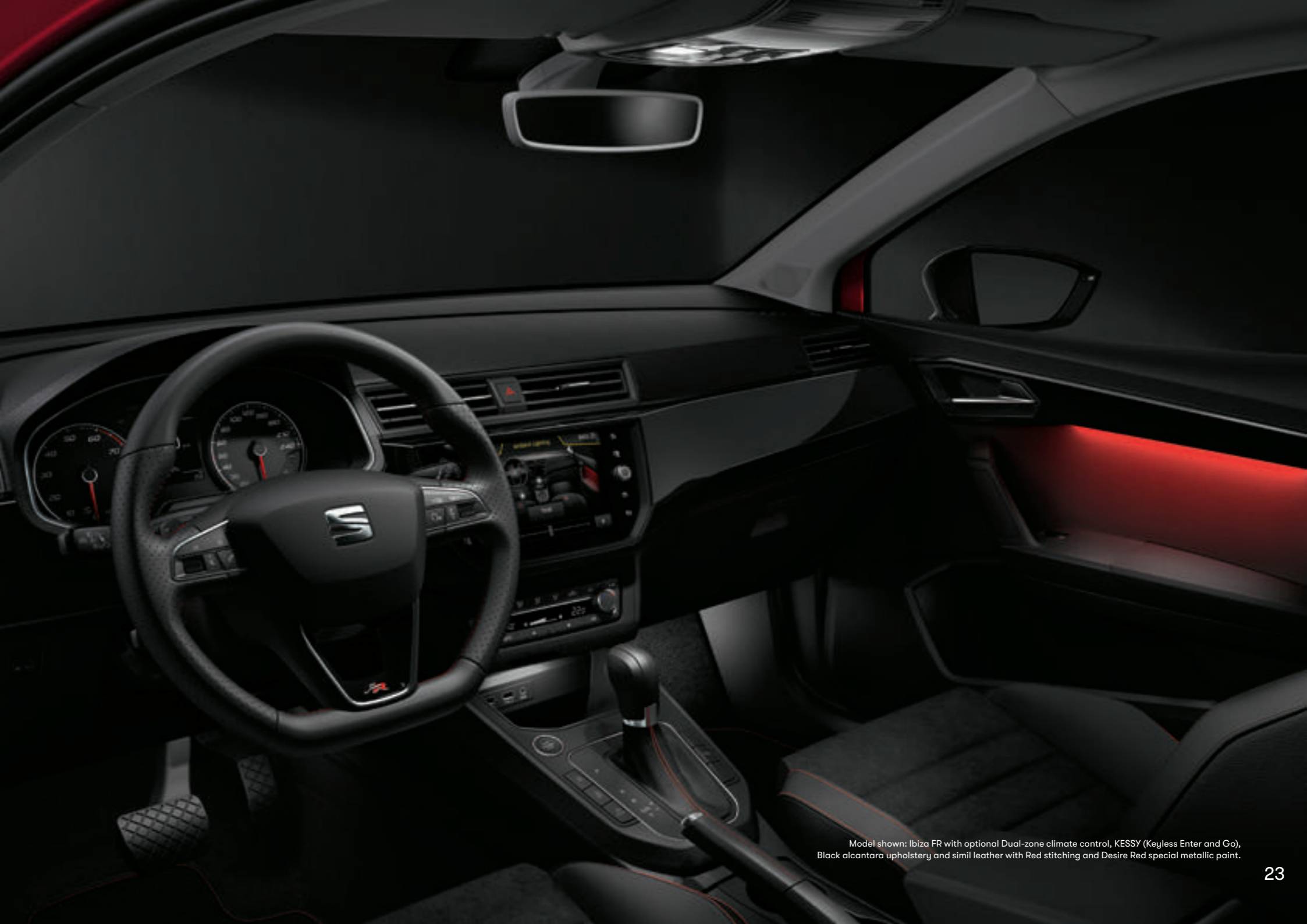
Model shown: Ibiza FR with optional Dual-zone climate control, KESSY (Keyless Enter and Go), Black alcantara upholstery and simil leather with Red stitching and Desire Red special metallic paint.