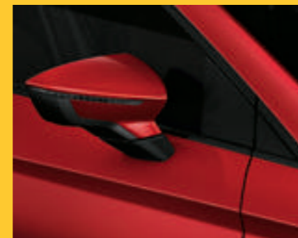
Desire Red*** S SE FR

S /S/ SE /SE/ FR /FR/ XC XCCELLENCE /XC/