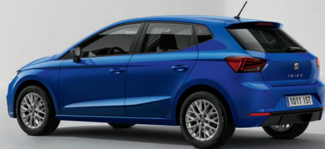
Model shown: Ibiza SE with optional 16" 'Design' alloy wheels, Vision Pack Plus and Mystery Blue metallic paint.