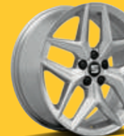
17" 'Dynamic' Alloy Wheels FR