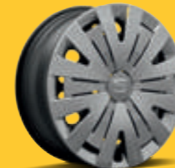
'Urban' Steel Wheels S