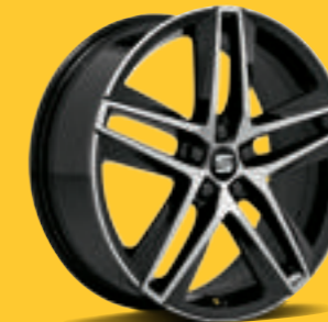
18" 'Performance' Bi-colour Machined Alloy Wheels FR