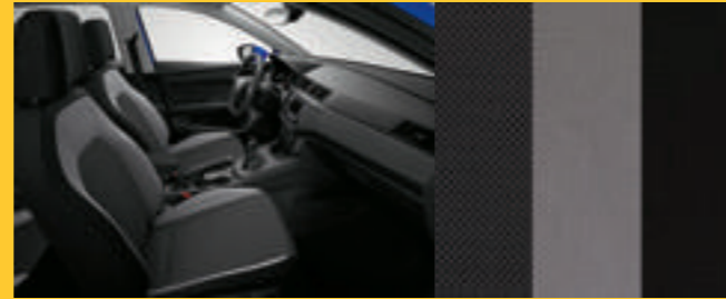
Orgad Grey Cloth SE