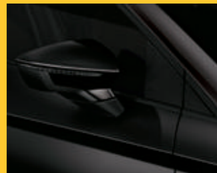
Midnight Black** S SE FR XC