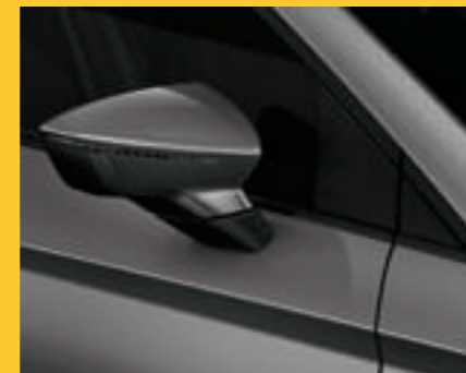
Monsoon Grey** S SE FR XC