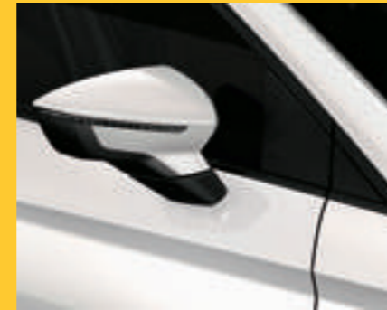
White* S SE FR XC