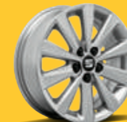
'Enjoy' Alloy Wheels SE