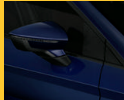
Mediterranean Blue* S SE FR XC

Make your statement with the perfect choice of colour.