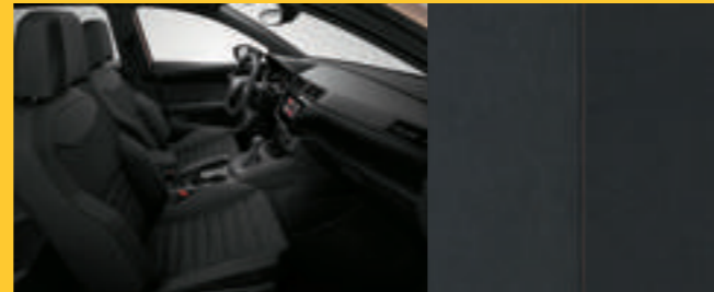
Black Alcantara with contrast stitching XC