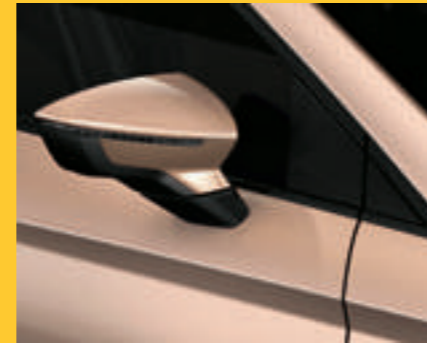
Mystic Magenta** S SE XC